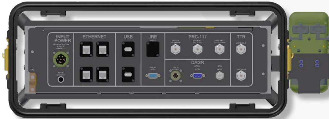
Rear Demarcation Panel