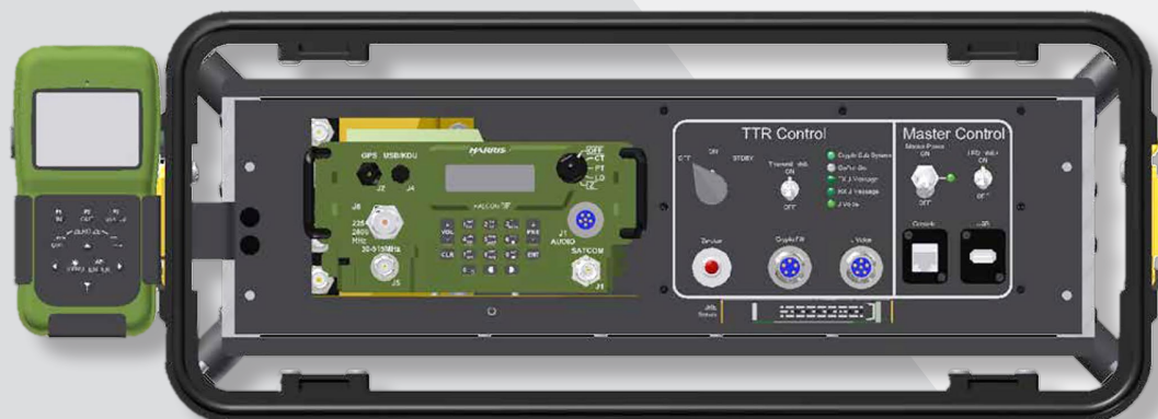
Front Panel Controls

TIGR 3U provides Tactical Edge Warfighters with a one box solution!